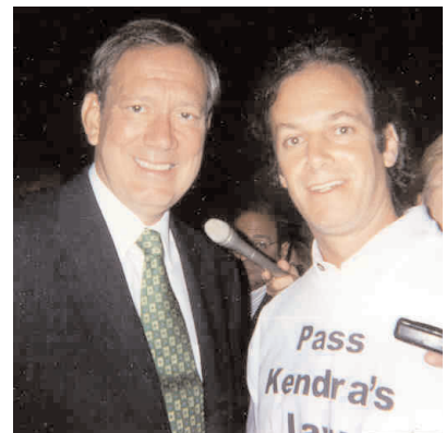
Kendra's Law is passed! Signed into law by New York's Governor George Pataki—See story inside.

Standards based on the need for treatment allow for a medical intervention before an individual spirals to the depths of his illness.